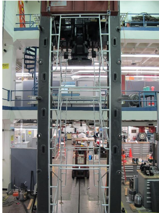
Loading test setup