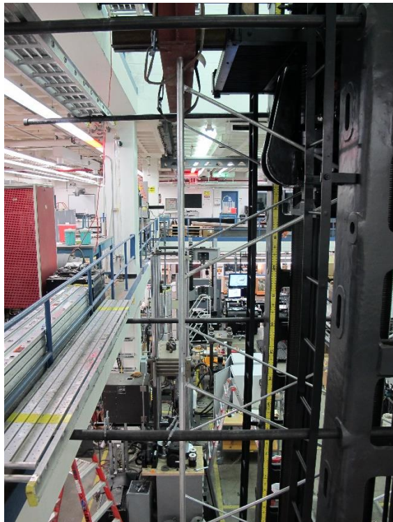
Before test (#1: 5' X 19' scaffold assembly)