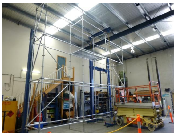
FIG.1 CORONET RINGLOCK SCAFFOLD TEST ASSEMBLY

Prior to erecting the test scaffold, the mass and dimensional attributes of each scaffolding component were measured and recorded for the determination of the assembled scaffold gravity dead loads ( G_d ). All measurements were conducted using calibrated MTS measuring devices and are provided in Appendix A of this report. MTS wishes to advise the reader that, as per the design of the CORONET Ringlock scaffold system, the ledger and transom components are interchangeable units and share similar dimensional attributes.