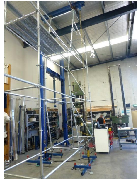
FIG.3 SCAFFOLD UNDER PEAK LOAD