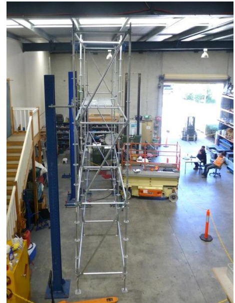
FIG.2 SCAFFOLD UNDER TEST

Load testing was to be conducted on two (2) laterally adjacent standards using an MTS loading beam mounted on top of the spigot ends of the test standards. The test standards were located at the third pair of laterally adjacent standards, or Bay #3 of the test structure (see Fig.2).